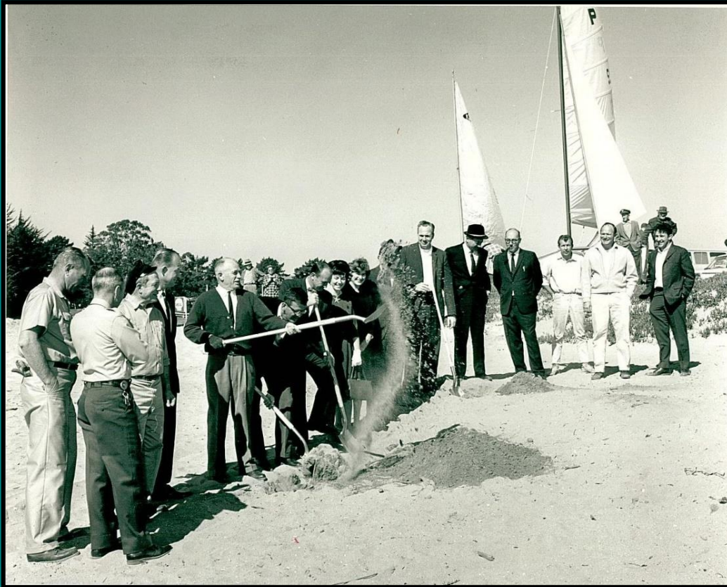
Groundbreaking for O'Neill Building, 1965

Objective: to use building and endowment for OSO's future.