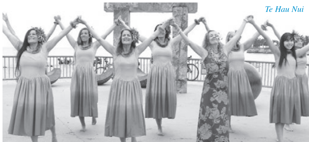
Te Hau Nui