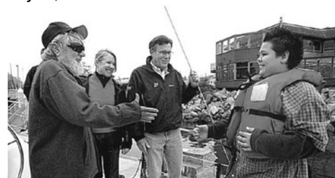
Jack O'Neill welcomes Radcliff student board the Team O'Neill in 2009

As we prepare for this landmark, we are asking you to send us your memories. Email your stories, photos, videos, and quotes to rachel@oneillseaodyssey.org . We want to highlight what these 25 years have meant to you, too! ♦